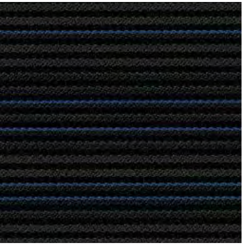
Black Cloth S|SVPLUS