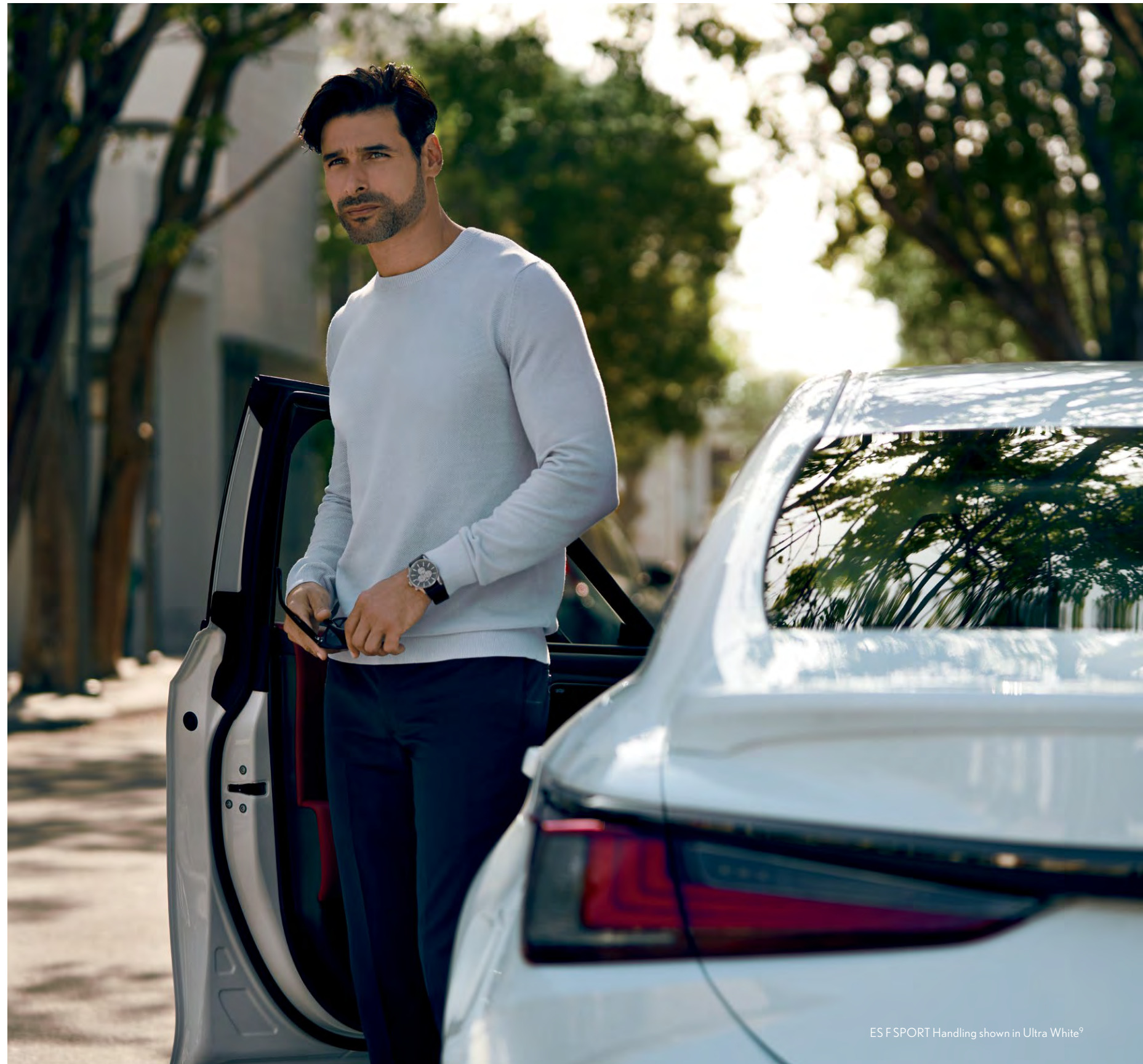
ES F SPORT Handling shown in Ultra White 9