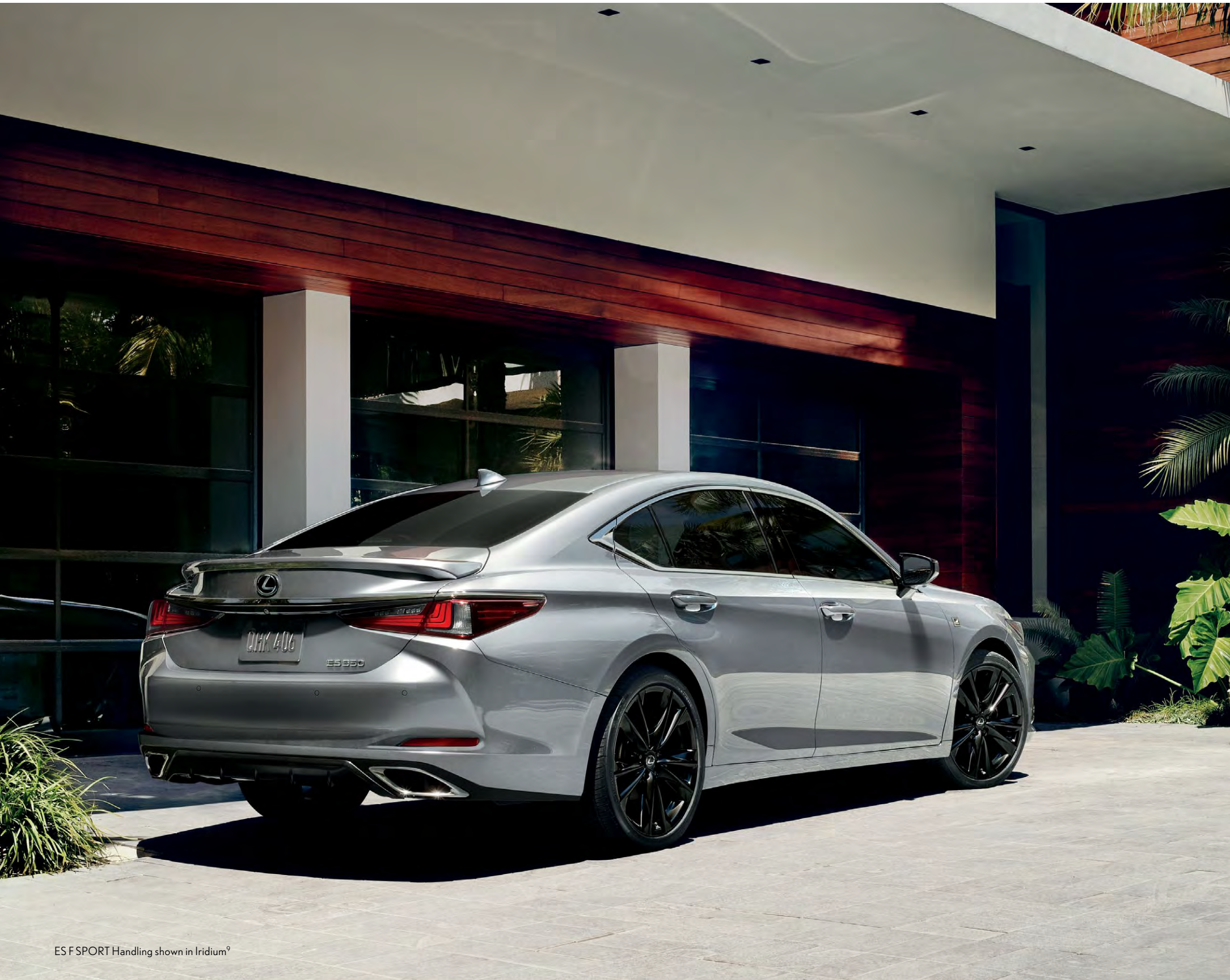
ES F SPORT Handling shown in Iridium 9