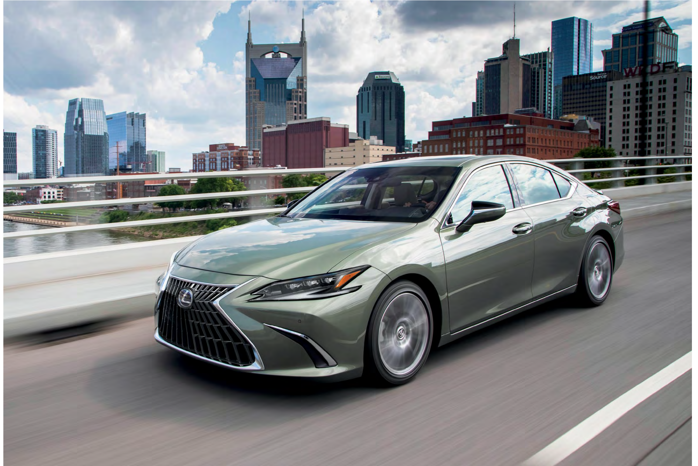
ESh shown in Sunlit Green

Combining next-generation hybrid technology and a highly potent 2.5-liter engine, this is the best of everything the ES has to offer. Its battery is not only remarkably small and lightweight, but also strategically placed as close to the middle of the vehicle as possible for optimized front/rear weight distribution and a lower center of gravity. And with paddle shifters that deliver driving dynamics similar to the ES 250 AWD and ES 350, the ES Hybrid and ES Hybrid F SPORT models bring you closer to the road than ever before. Pairing powerful performance with a 44-MPG combined estimate, 2 it isn't just the most fuel-efficient Lexus sedan ever—it's the most fuel-efficient among all non-plug-in luxury vehicles, 1 period.