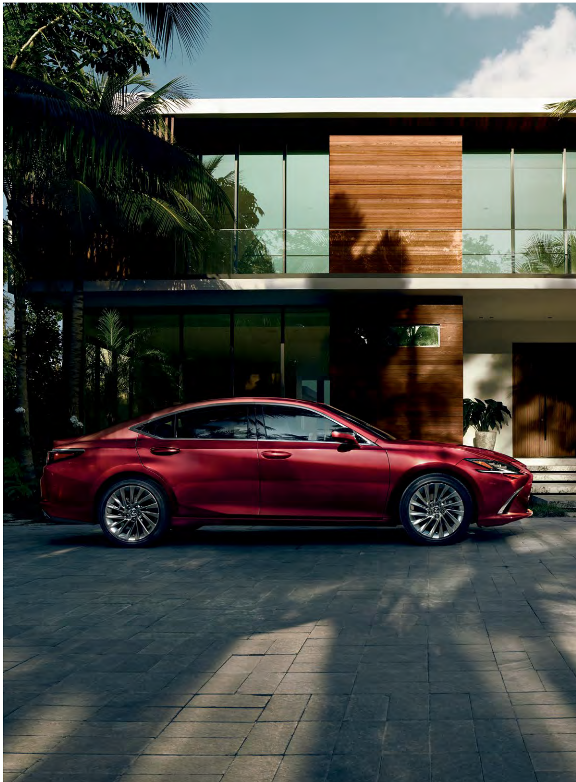
ES shown in Matador Red Mica