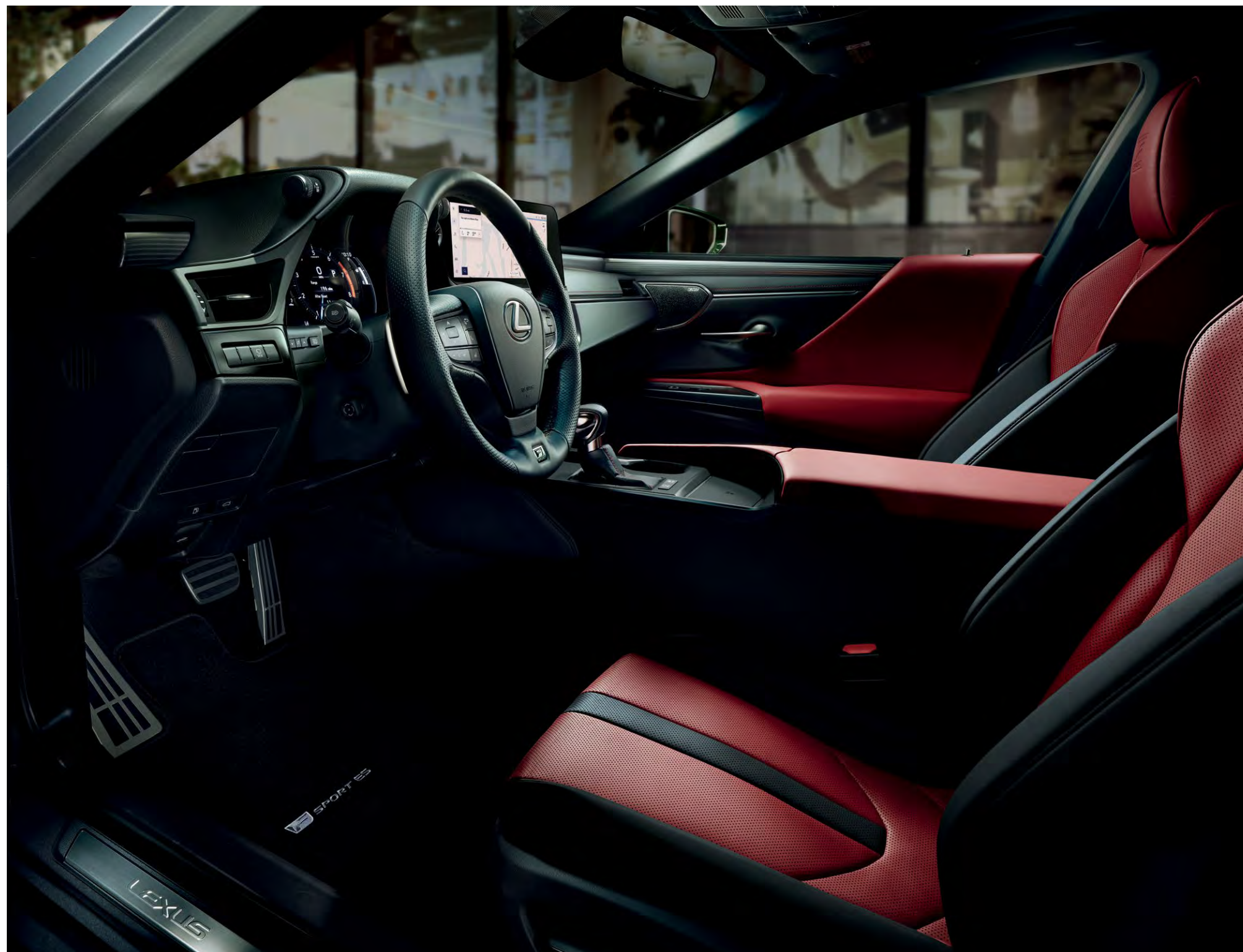
ES F SPORT Handling shown with Circuit Red NuLuxe® and Hadori Aluminum interior trim