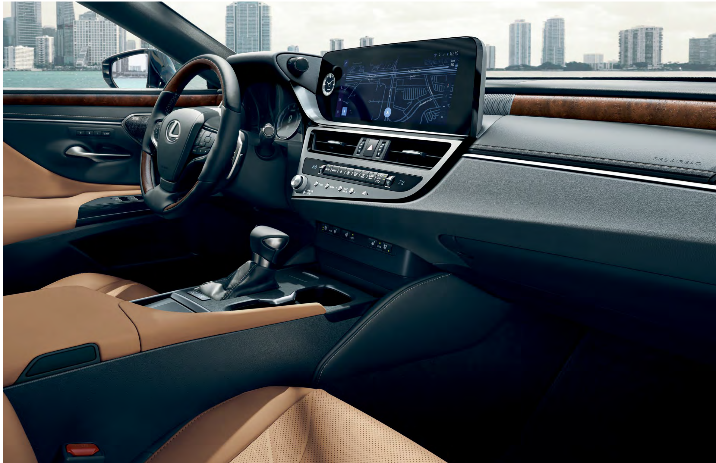
ESh shown with Palomino semi-aniline leather and Open-Pore Brown Walnut interior trim

With contemporary styling and cutting-edge technology, the ES offers a refreshing point of view on modern luxury. Discover thoughtful amenities like 10-way power-adjustable seats with available heating and ventilation, designed to envelop you and connect you to the road. Unlike conventional ventilated seats, these pull air directly from the climate-control system to more effectively and efficiently cool you. These refined luxuries are complemented by numerous expressions of modern style and technology—from an intuitively positioned available 12.3-inch touchscreen display to available ambient lighting that accentuates the sculpted lines throughout the cabin.