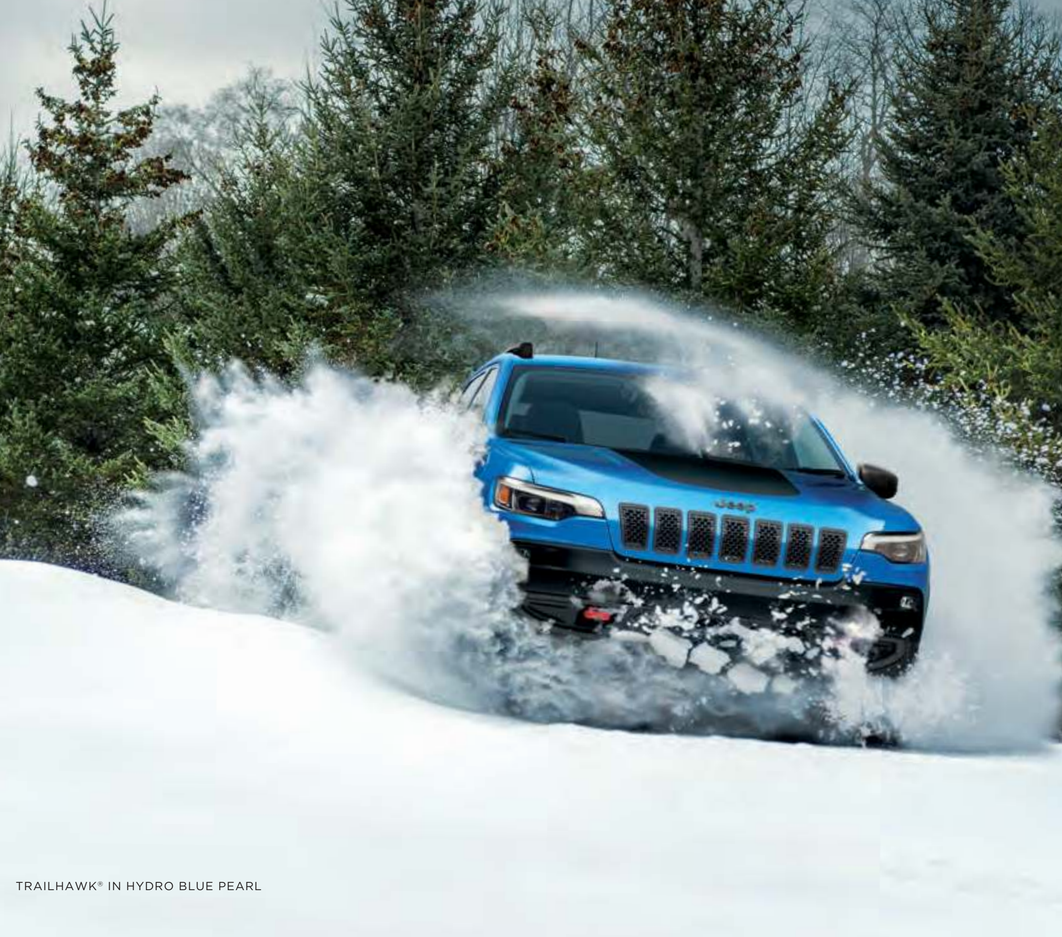
TRAILHAWK® IN HYDRO BLUE PEARL