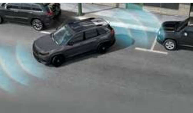
Parallel and Perpendicular Park and Unpark Assist System 16