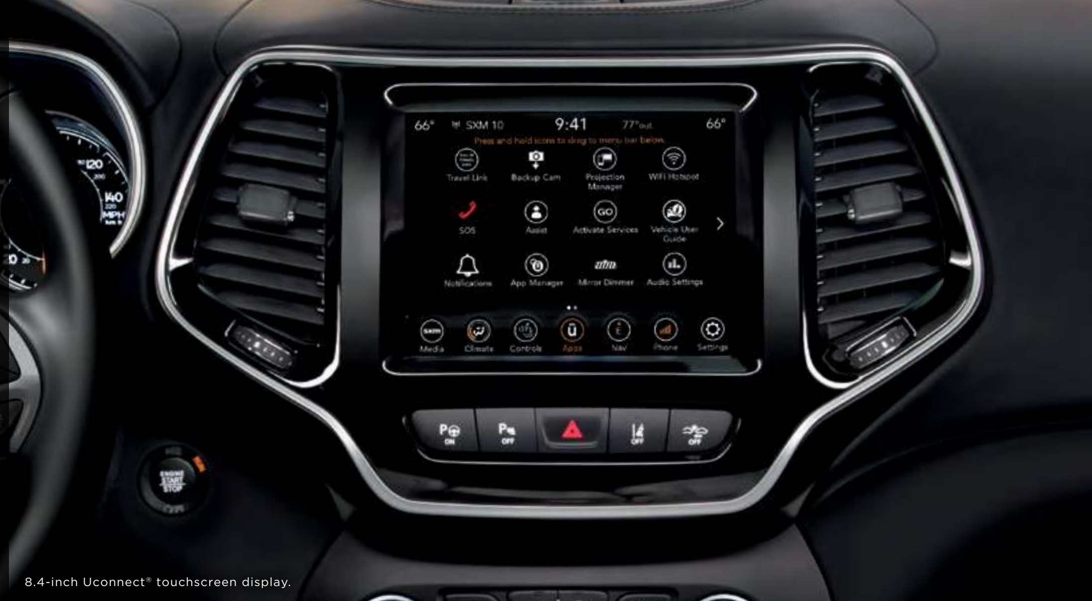
8.4-inch Uconnect® touchscreen display.

REGULATE YOUR VEHICLE'S TEMPERATURE , activate heated front seats and steering wheel, and so much more — all from the touchscreen. A drag-and-drop menu allows you to highlight your top six favorite features and services so they're always in sight on your 8.4-inch Uconnect® touchscreen display.