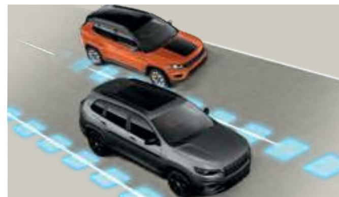
Blind Spot Monitoring (BSM) 22 and Rear Cross-Path Detection 21 Systems

When it comes to standard features in safety and security, the benchmark is raised for Jeep Cherokee. Every model arrives with Blind Spot Monitoring (BSM) 22 and Rear Cross-Path Detection 21 Systems and LaneSense® Lane Departure Warning with Lane Keep Assist. 20 With an array of available sensors keeping watch of your perimeter and a cabin engineered with seven standard air bags, 17 Cherokee is designed to help deliver peace of mind when you're behind the wheel.