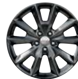
18-inch Hyper Black Wheel

ALTITUDE LUX IN GRANITE CRYSTAL METALLIC