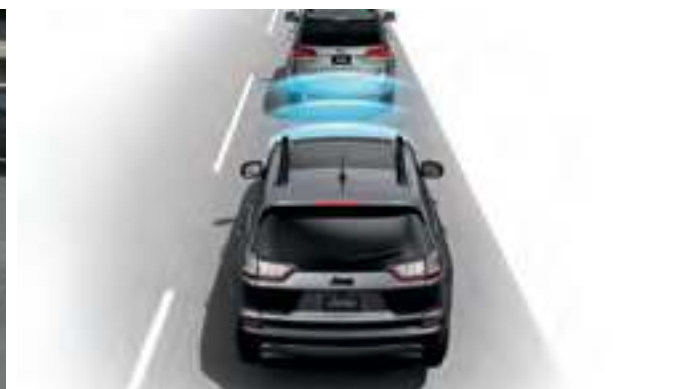
Adaptive Cruise Control with Stop and Go (ACC STOP) 19