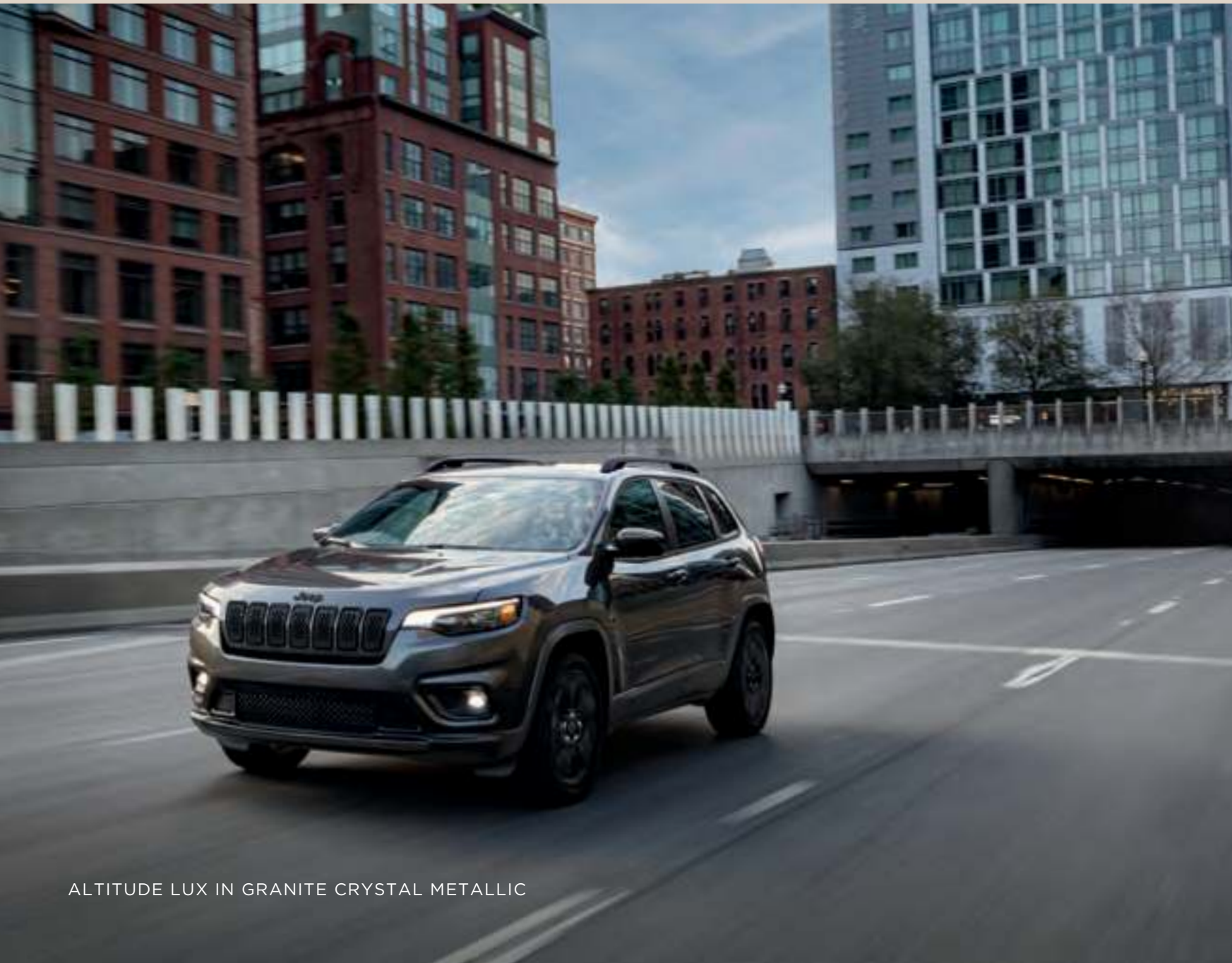
ALTITUDE LUX IN GRANITE CRYSTAL METALLIC

2.4L TIGERSHARK ® MULTIAIR ® I-4 ENGINE WITH ESS TECHNOLOGY This engine is engineered to deliver the best of both worlds: a quiet and refined performance backed by the ability to power through tough terrain. This fuel-efficient workhorse is standard on Altitude Lux.