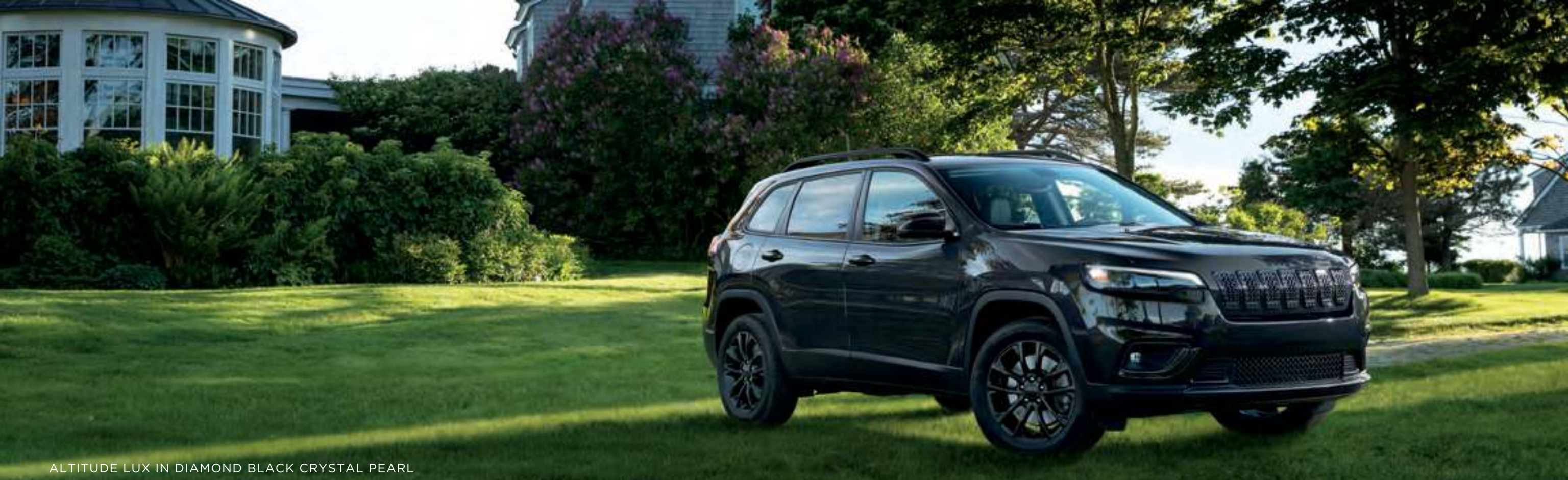
ALTITUDE LUX IN DIAMOND BLACK CRYSTAL PEARL