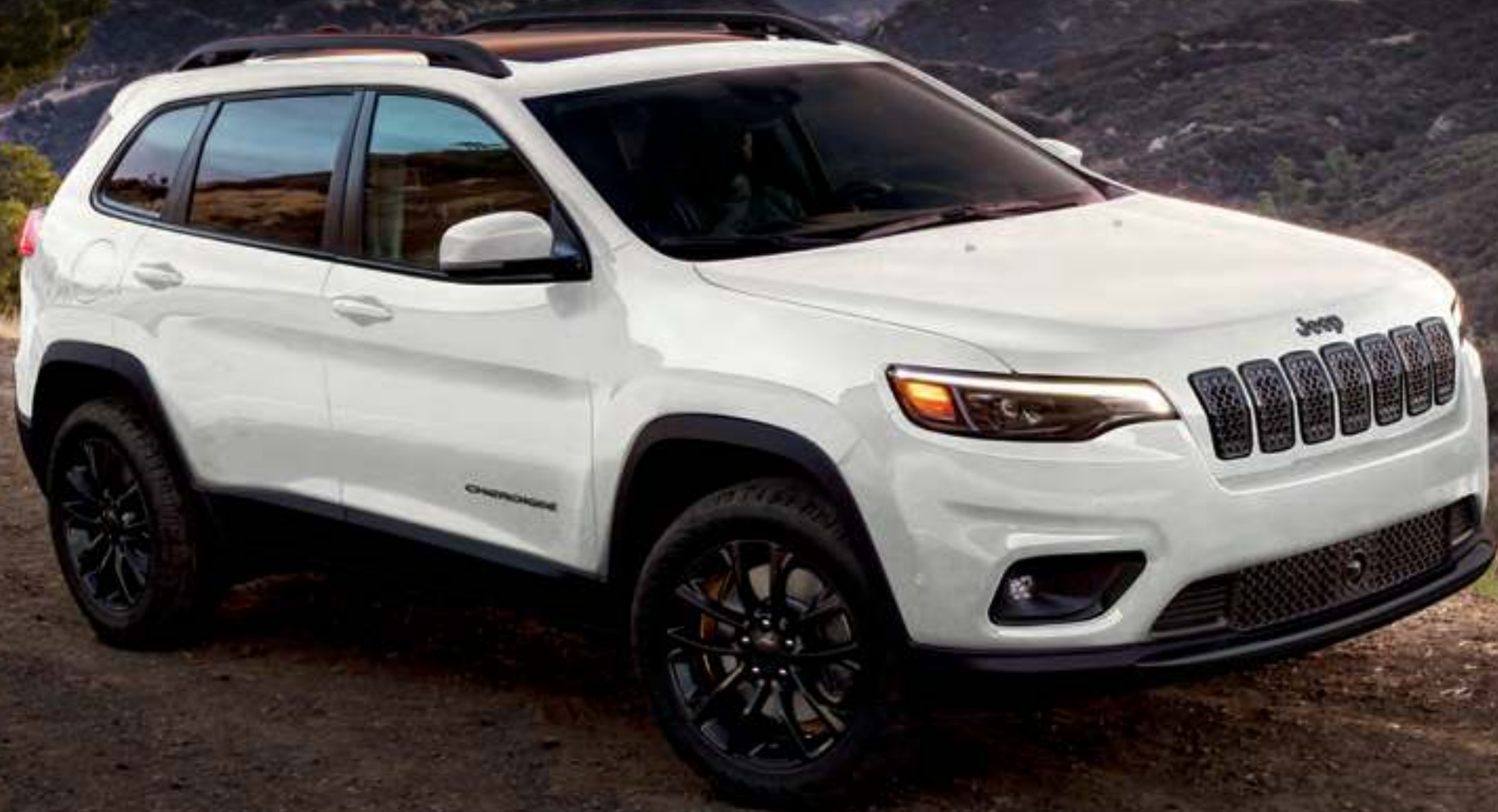
ALTITUDE LUX IN BRIGHT WHITE

THE JEEP® BRAND IS PROUD TO OFFER SOME OF THE BEST OWNERSHIP SUPPORT PROGRAMS AVAILABLE ANYWHERE