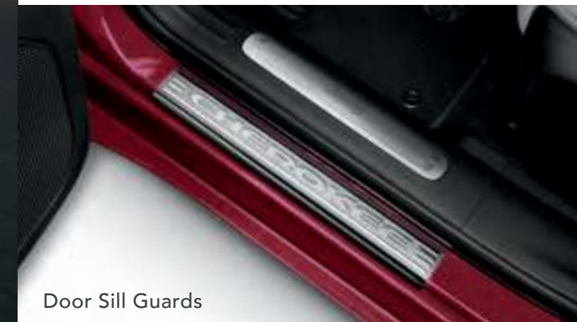
Door Sill Guards