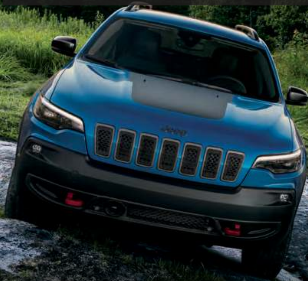
TRAILHAWK® IN HYDRO BLUE PEARL

Your Trail Rated Cherokee Trailhawk arrives hardwired with the hardware that includes the Jeep® Active Drive Lock Four-Wheel-Drive (4WD) System and a set of skid plates that help protect your vehicle's most vulnerable parts when you're traveling over tough terrain. Rise to the greatest heights of on- and off-road mastery with Jeep Cherokee. This renowned and capable SUV boasts an elite pedigree born of legendary strength and timeless style.