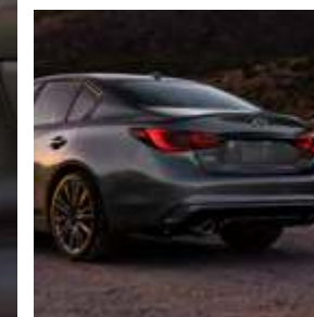
U.S. model shown.