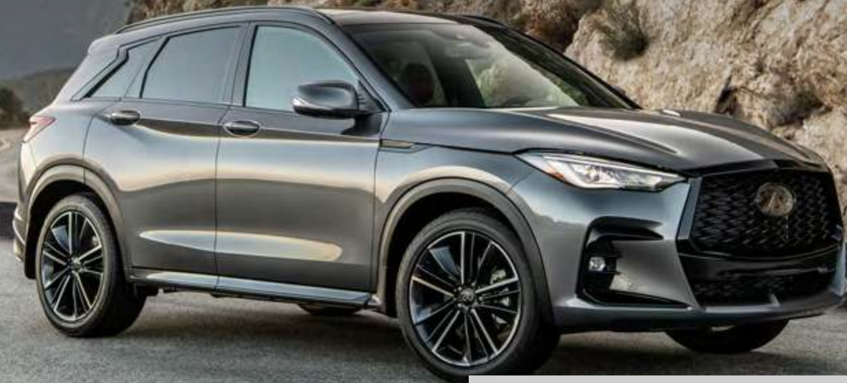
QX50 Sport trim shown.