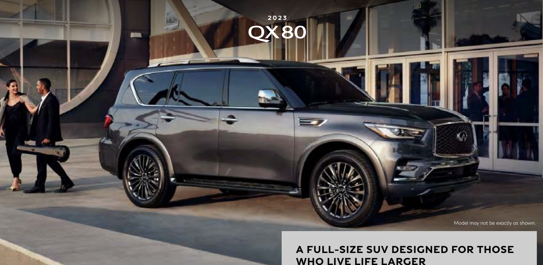
Model may not be exactly as shown.