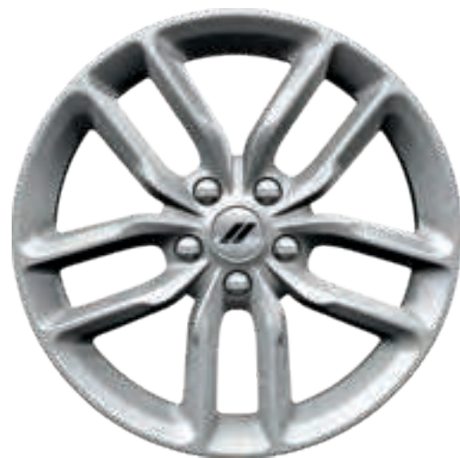
20 by 8-inch Fine Silver // (WHJ) Standard