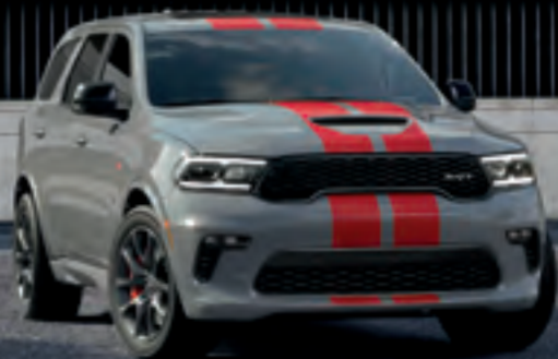
DURANGO SRT HELLCAT // shown in Destroyer Grey with available Flame Red dual stripes and SRT® Black Package.