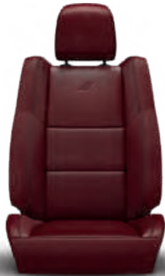
Nappa Leather trim with Nappa Axis II perforated inserts and Ruby Red accent stitching (Available in Black/Ebony Red)