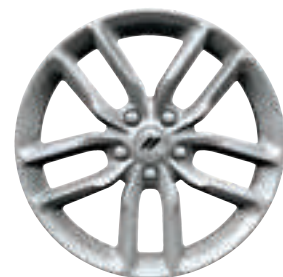
20 by 8-inch Fine Silver // [WHJ] Standard