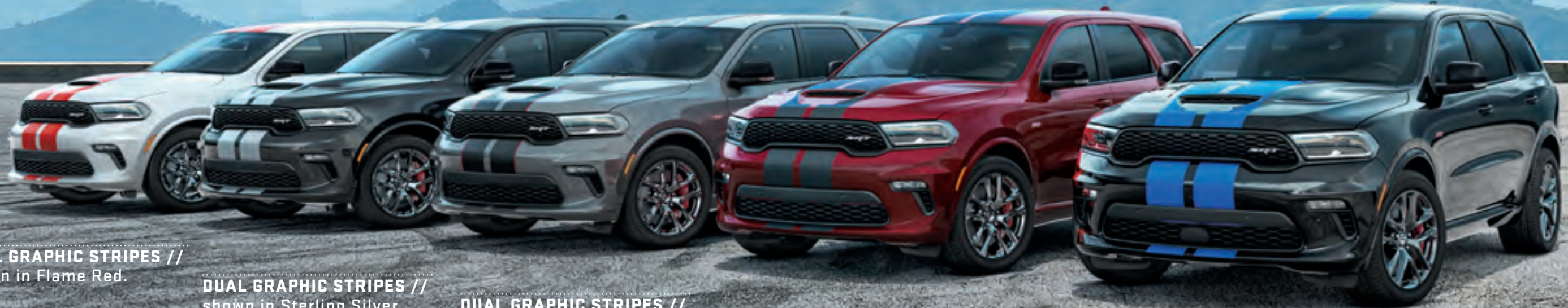
DUAL GRAPHIC STRIPES // shown in Flame Red.