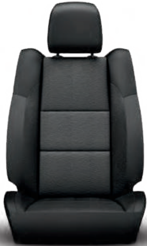
Carolina Mesh/Shift (Standard in Black)