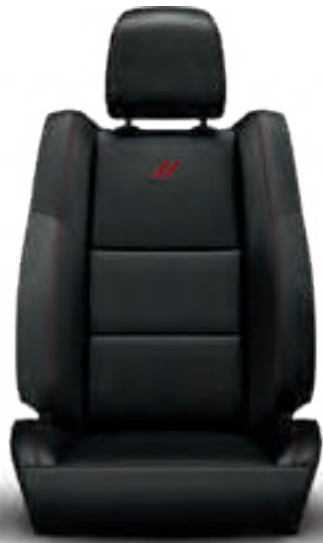
Nappa Leather trim with Nappa Axis II perforated inserts and Ruby Red accent stitching (Standard in Black)