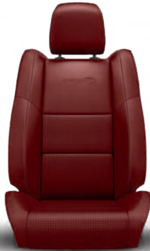
Laguna Leather trim with Laguna Axis II perforated inserts, Silver accent stitching and SRT embossed logo (Available in Black/Demonic Red)