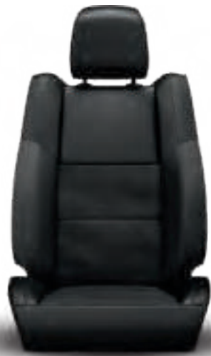
Nappa Leather trim with Suede Axis II perforated inserts and Ruby Red accent stitching (Available in Black)