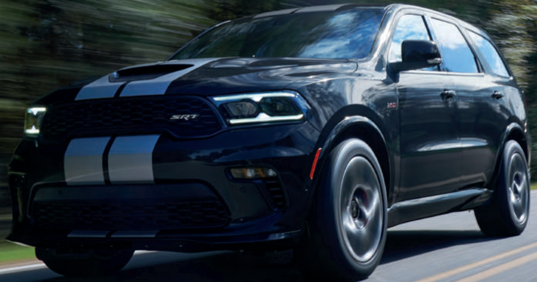
DURANGO SRT® 392 // shown in DB Black with Sterling Silver dual graphic stripes.