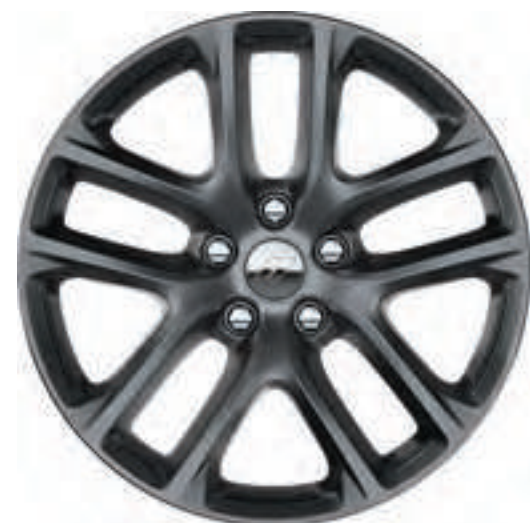
20 by 10-inch Hyper Black // (WHW) Standard