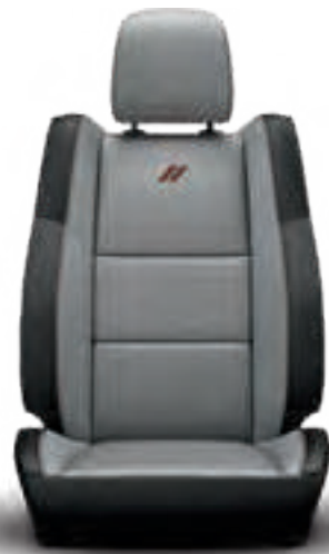
Nappa Leather trim with Nappa Axis II perforated inserts and Ruby Red accent stitching (Available in Black/Vitra Grey)