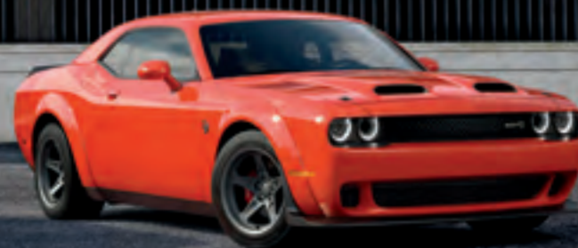
CHALLENGER SUPER STOCK // shown in Go Mango.