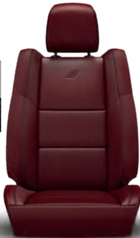
Nappa Leather trim with Nappa Axis II perforated inserts (Available in Black, Black/ Ebony Red, Black/Vitra Grey)