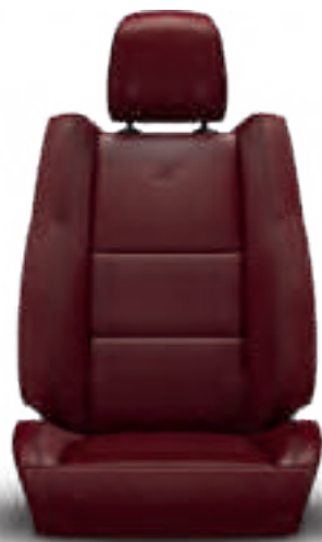
Nappa Leather trim with Nappa Axis II perforated inserts and Ruby Red accent stitching (Available in Black/Ebony Red)