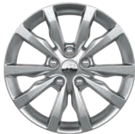
18 by 8-inch Technical Silver // (WP1) Standard