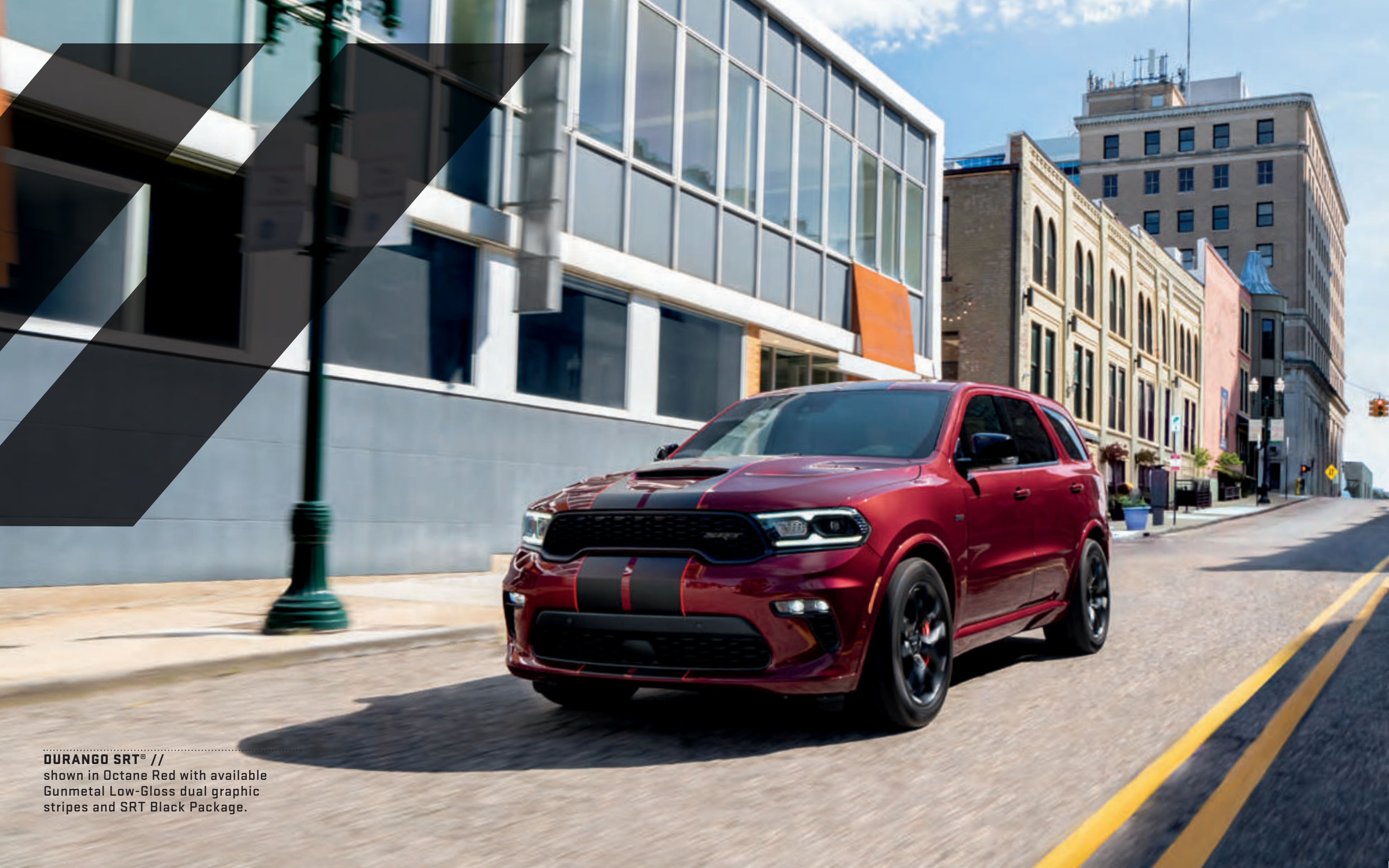
DURANGO SRT® // shown in Octane Red with available Gunmetal Low-Gloss dual graphic stripes and SRT Black Package.