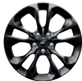
20 by 8-inch Black Noise // [WH4] Available