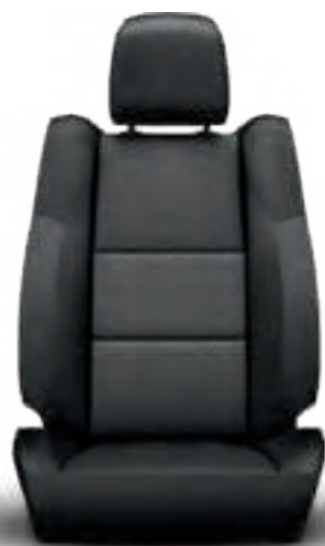
Carolina Mesh/Shift (Standard in Black)