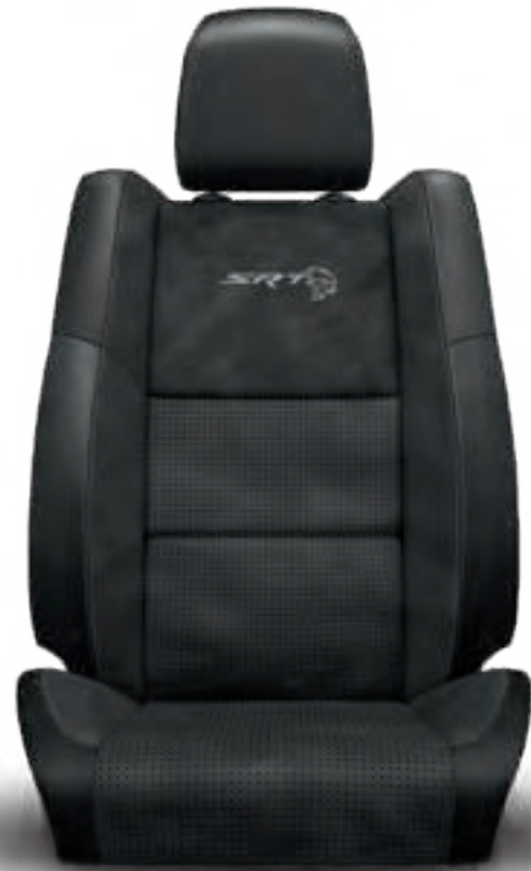
Nappa Leather trim with Suede Axis II perforated inserts, Silver accent stitching and SRT® embroidered logo (Standard in Black)