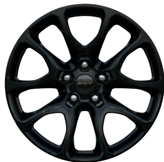
20 by 10-inch Lights Out // (WHE) Available