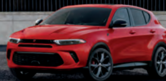
HORNET GT PLUS // shown in Hot Tamale with available Track Pack and Blacktop Package.