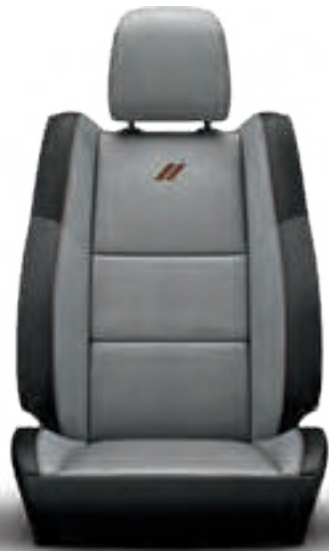
Nappa Leather trim with Nappa Axis II perforated inserts and Ruby Red accent stitching (Available in Black/Vitra Grey)