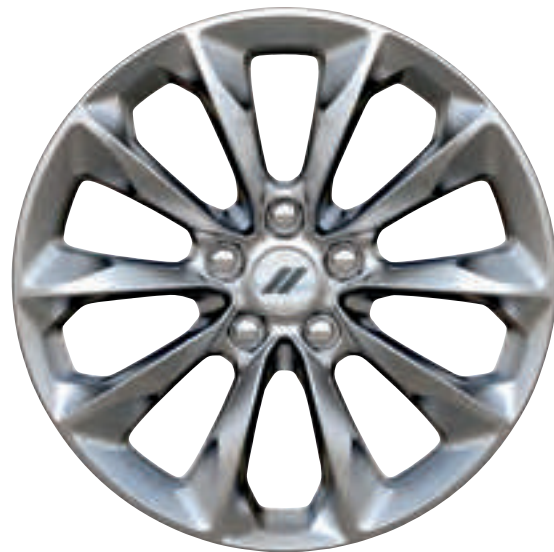
20 by 8-inch Satin Carbon // (WHT) Standard