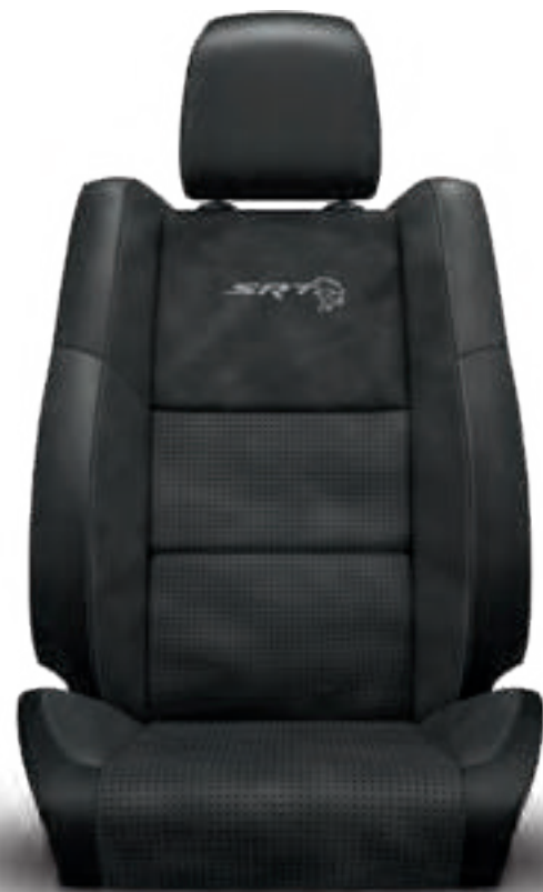
Nappa Leather trim with Suede Axis II perforated inserts and Silver accent stitching (Standard in Black)