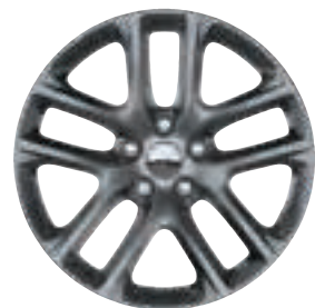
20 by 10-inch Hyper Black // [WHW] Available