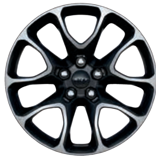
20 by 10-inch Machine Face with Dark pockets // (WHG) Standard