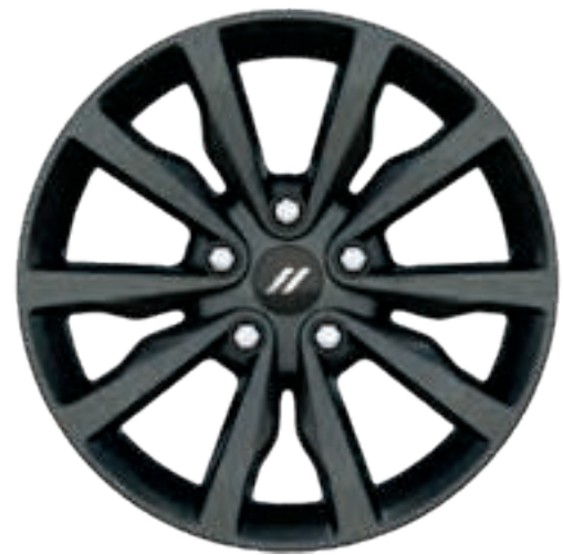
18 by 8-inch Black Noise // (WBA) Available