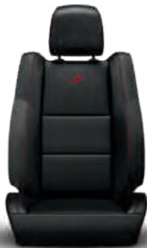
Nappa Leather trim with Nappa Axis II perforated inserts and Ruby Red accent stitching (Available in Black)