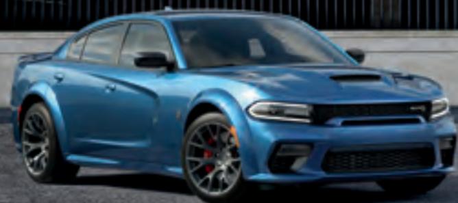
CHARGER SRT HELLCAT® REDEYE JAILBREAK // shown in Frostbite.