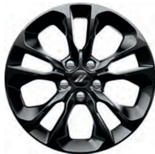
20 by 8-inch Black Noise // (WH4) Available